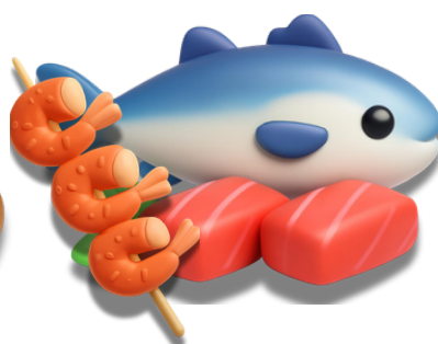
fisk og skalldyr seafood