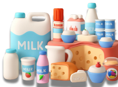
melkeprodukter dairy/milk products