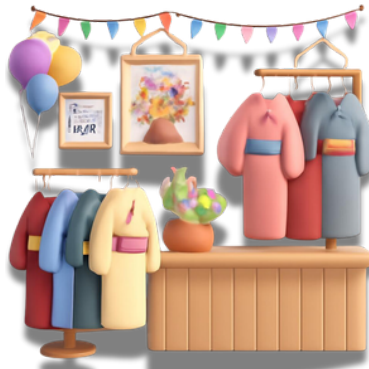
klesbutikk clothing store