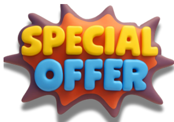
tilbud offer, special deal