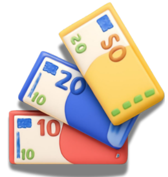
krone plural: kroner local currency