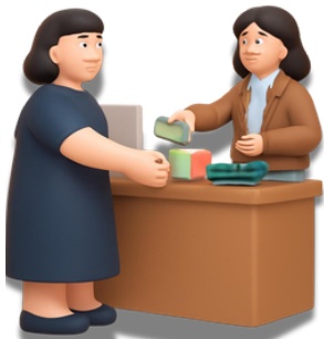
vekslepenger small change