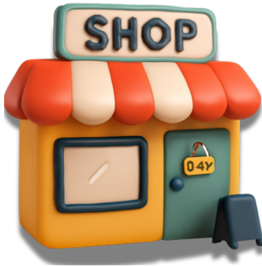
butikk shop, store