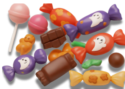
góðgæti, sötmeti candy