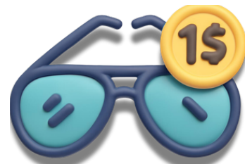
billingur, ódýrur cheap