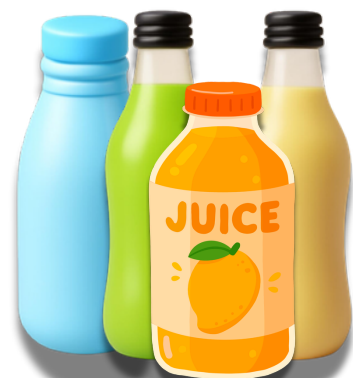
flöskupant bottle deposit