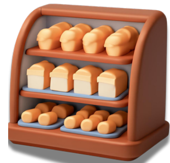
bäbbmogissto food case