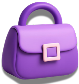
bunnga purse, wallet