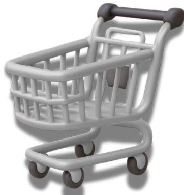
innkeypskurv shopping cart