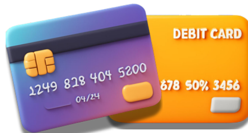
krediitkaart credit card