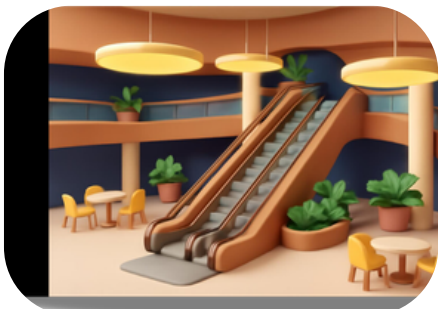
kaubanduskeskus shopping mall