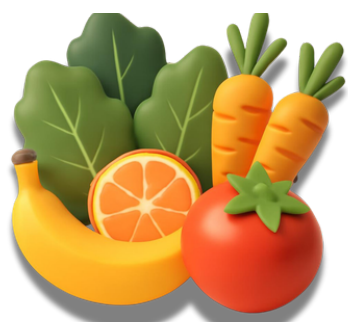
puu- ja köögiviljad fruits & vegetables