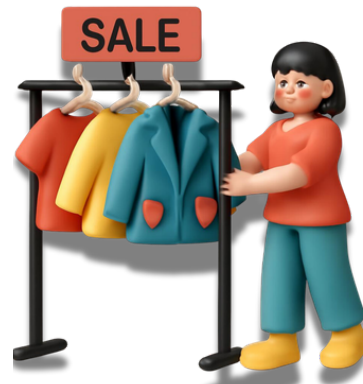
kupong sale (when referring to shopping)