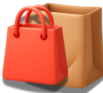
ostukott shopping bag