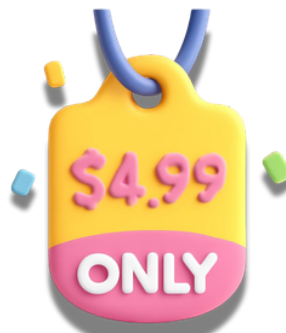
godt køb bargain