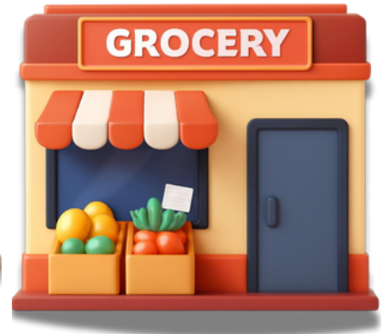
fødevarerbutik grocery store