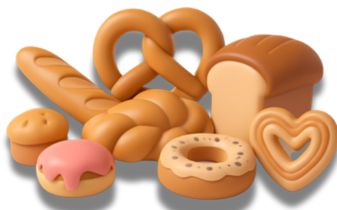
bageriprodukter bakery products