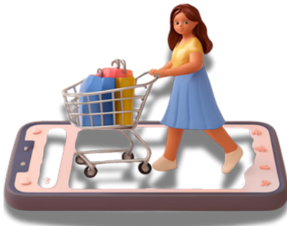
netbutik online store