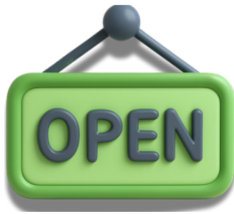
åbningstider opening hours