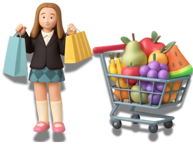
indkøb , shopping shopping