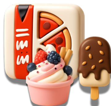
frossen mad frozen foods