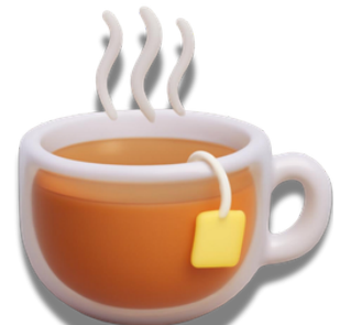
warmt te (n.) hot tea