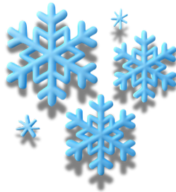
sniyo (m.) snow