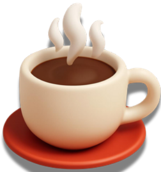
kaffi (n.) coffee