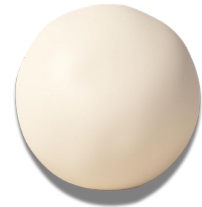
sniyoboll (m.) snowball