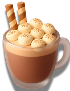
kakao (n.) hot cocoa, hot chocolate