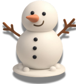
sniðogubb (m.) snowman