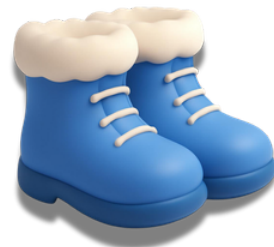
witterstyvel (n.) winter boots