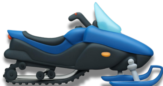
frátádråj (f.) snowmobile