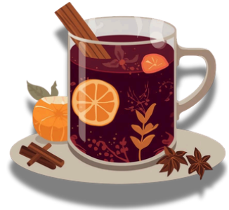
glögg (m.) warm seasonal drink