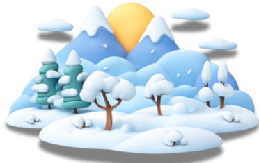
witter (m.) winter