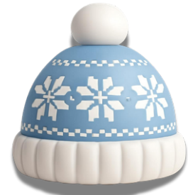
etta (f.) winter hat