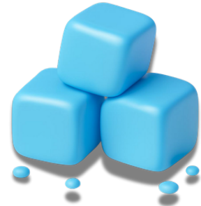
ais (m.) ice