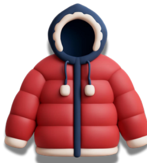
witterjakk (f.) winter coat