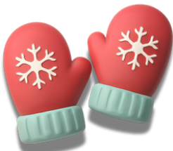
uotter (m.) mittens