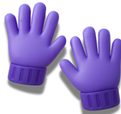
anske (m.), uott (m.) gloves