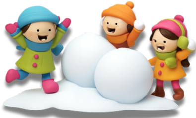
sniðobollskrig (n.) snowball fight