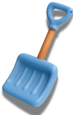
sniðospaði (m.) sniðostjyffel (m.) snow shovel