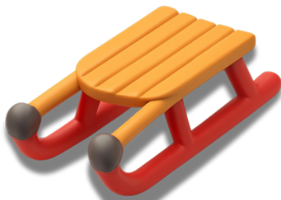
tjåke (m.) sled