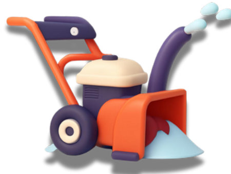
sniðoslingur (f.) sniðoweðerkwenn (f.) snow blower