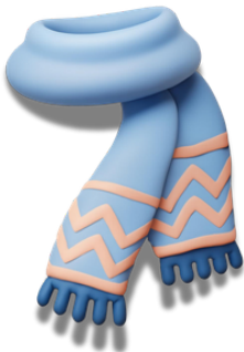
åsermkläð (n.) scarf