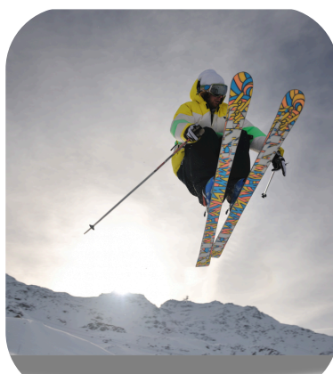
sabetnjuikun ski jumping