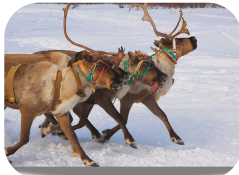
heargegilvu reindeer racing