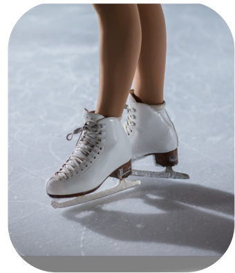
luisten ice skating