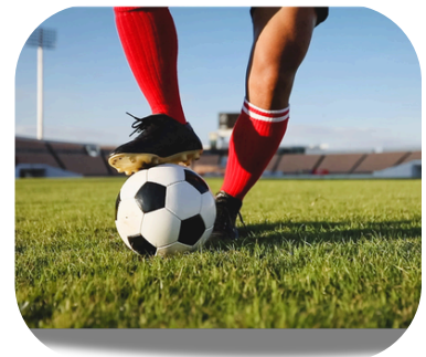
spábbačiekčan US: soccer UK: football