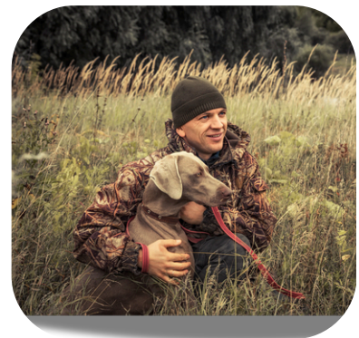
pivdo hunting, fishing