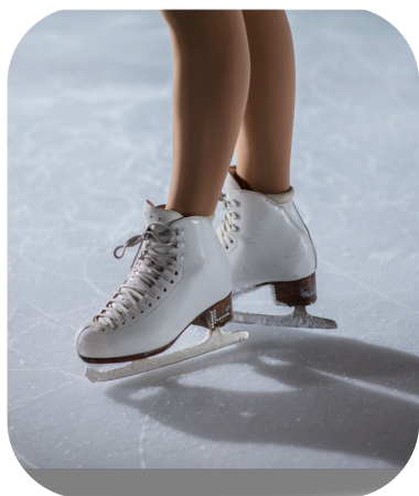
luistelem, luistám ice skating