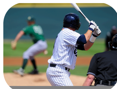
hornabóltur, baseball baseball