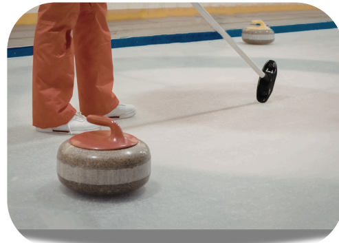
curling, íssteinleikur curling