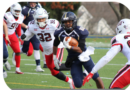
amerikanskur fótbóltur US: football UK: American football