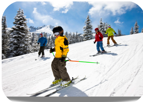
skíðrenning, skíðgonga, skíðítrótt skiing