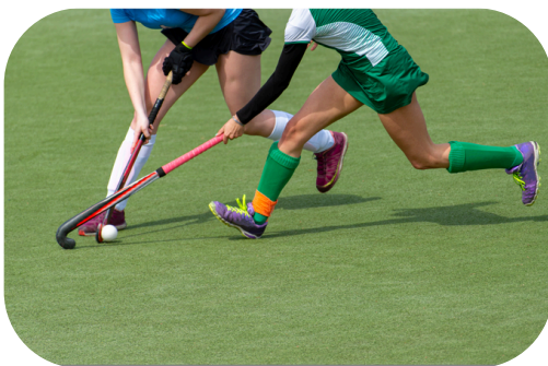
maahoki field hockey