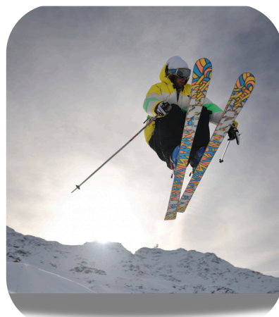
suusahüpped ski jumping