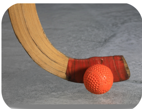
jäepall, bandy bandy