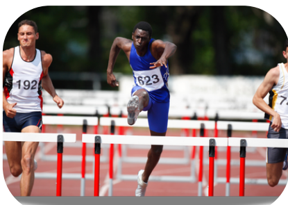
kergejõustik track and field