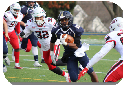
Ameerika jalgpall US: football UK: American football