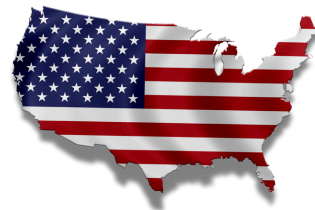
Ienaðstatär Amierik United States (of America), America