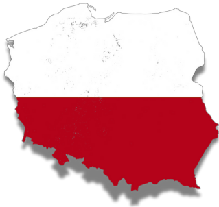
Poln, Puoln Poland