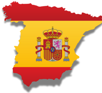
Spanien, Spannien Spain