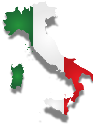
Italia (older form), Italien Italy