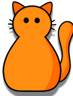
brandguol, guolroð orange