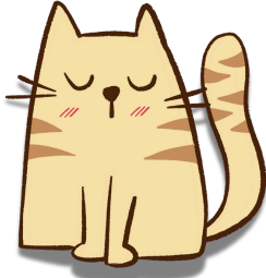
katt (m.) cat