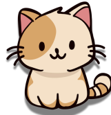
kattungg (m.) kitten