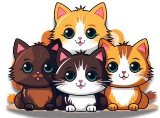
stuoð (n.) litter