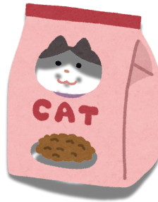
kattjätä (n.) cat food