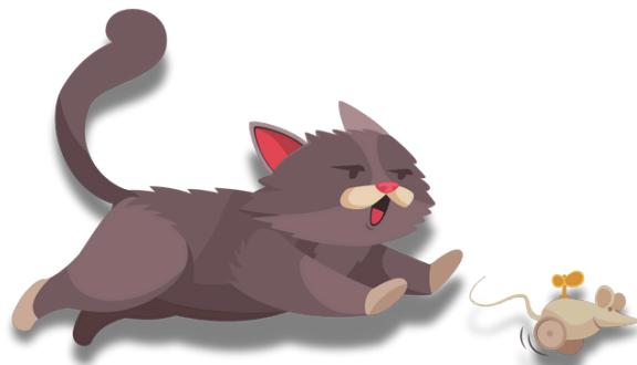
kattn old etter måysum the cat chases the mouse