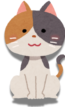
katta (f.) female cat